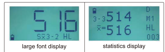
large font display